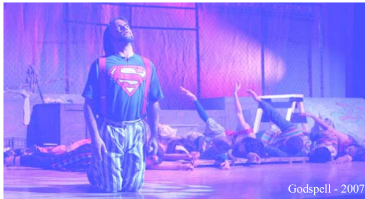
Godspell - 2007