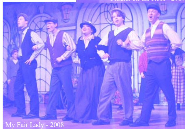
My Fair Lady - 2008

Fill out this portion and return it with your check to NRTG, PO Box 160, North Tonawanda, NY 14120