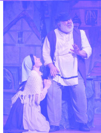
Fiddler on the Roof - 2007